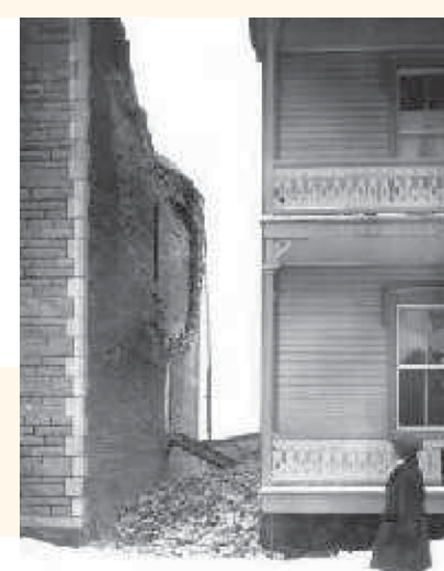
Damage in Shawinigan, 1925.

3. Lower St. Lawrence - Although there is no evidence of a large earthquake in the past, the region at the mouth of the St. Lawrence River experiences continuing moderate earthquake activity.